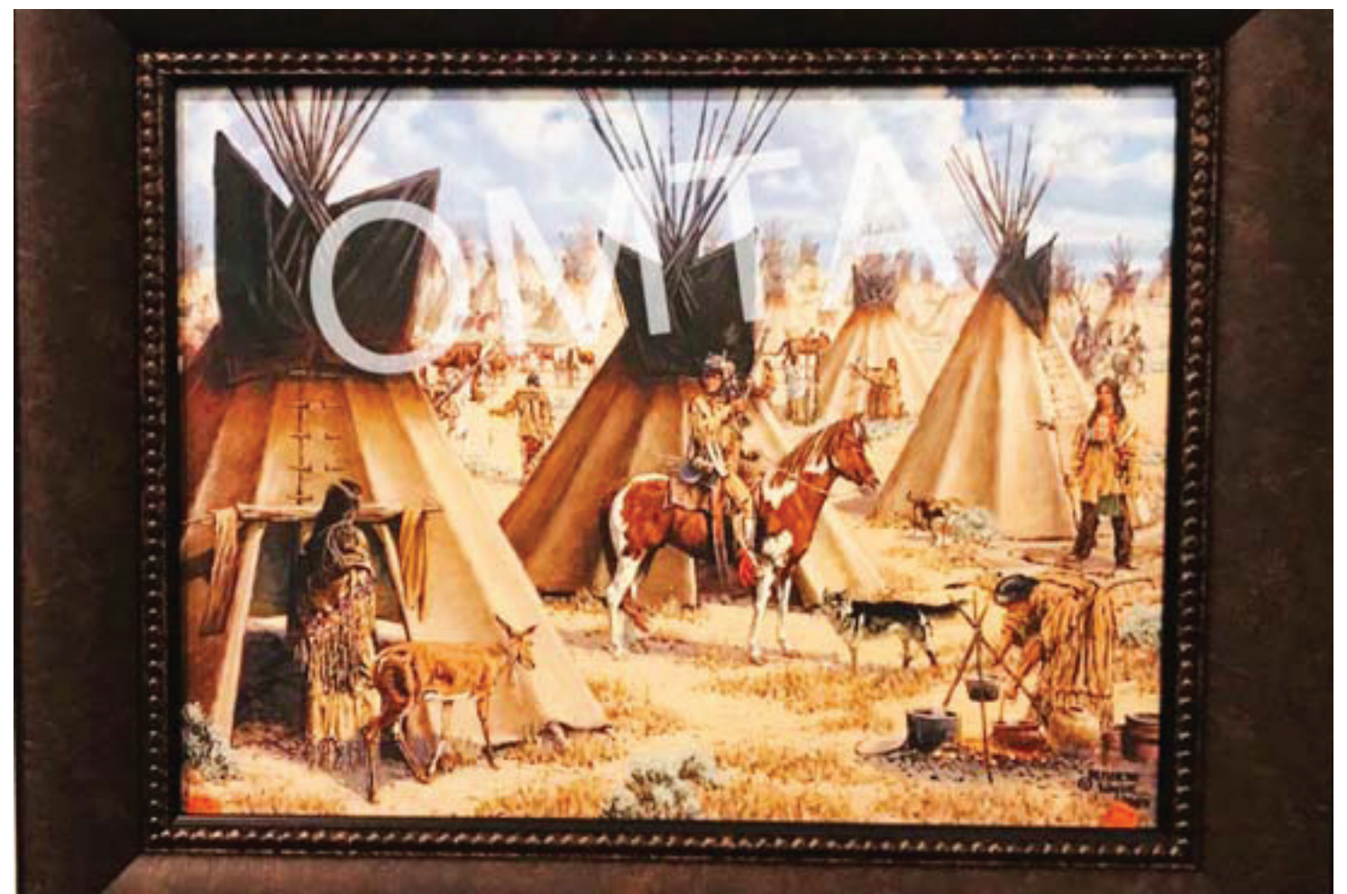
ON DISPLAY: Above is one of several Wyatt prints on display at Mobeetie Museum.

A full calendar of events for (Continued Page 2)