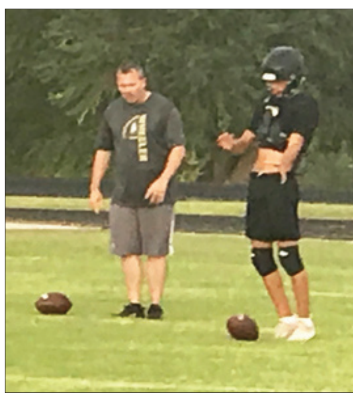
GETTING READY FOR ANOTHER WINNING SEASON: The Wheeler Mustangs have been on the practice field since August 2 getting in shape and ready to meet Munday Friday night. Six seniors will be returning this year.

Friday Night Lights SCRIMMAGE Wheeler Mustangs versus Munday August 20, 2021