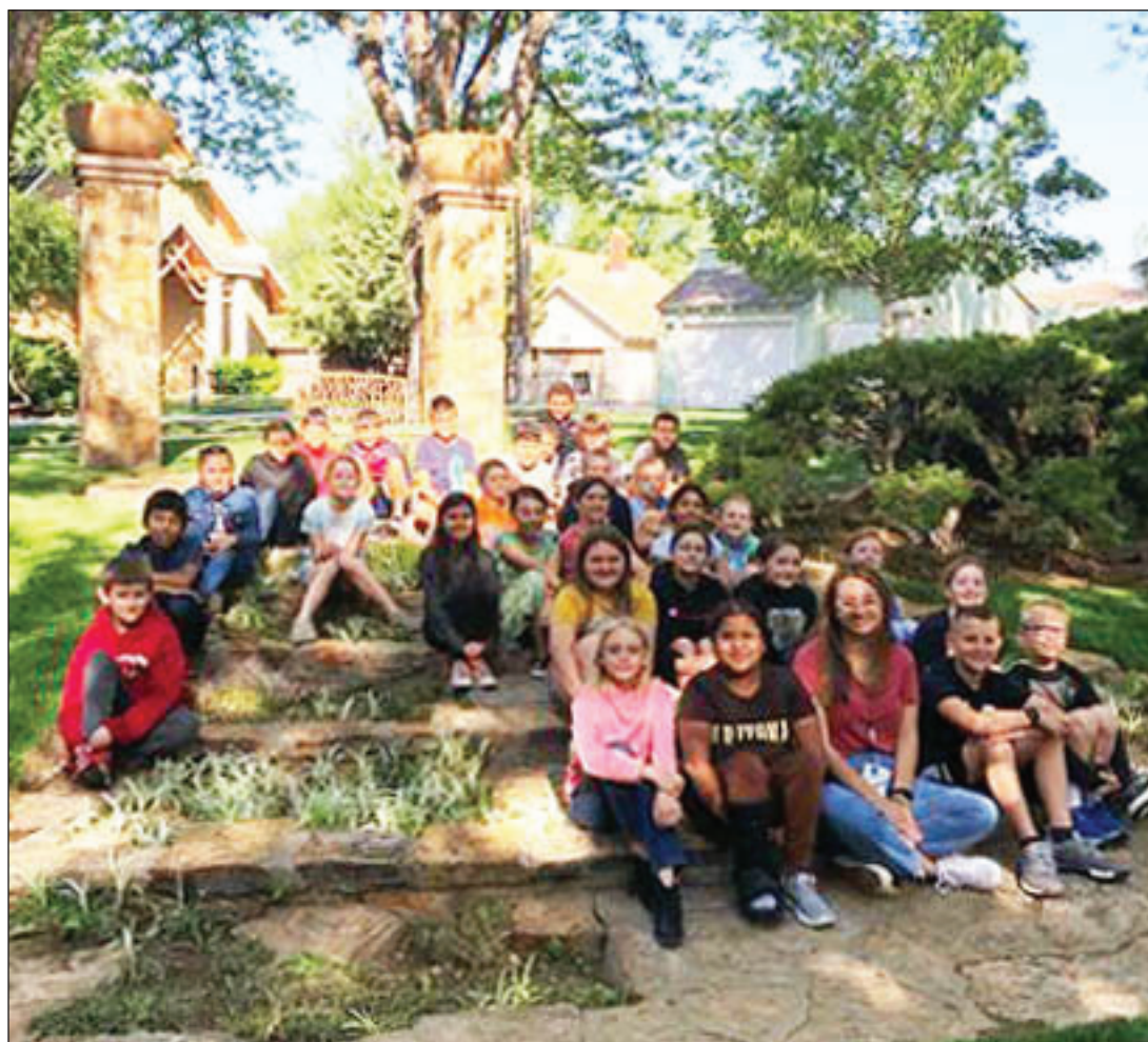
The first and second grade classes traveled to Canadian.

A wife complains to her husband, "Just look at that couple down the road, how lovely they are. He keeps holding her hand, kissing her, holding the door for her. Why can't you do the same?" The husband says, "Are you mad? I barely know that woman!"