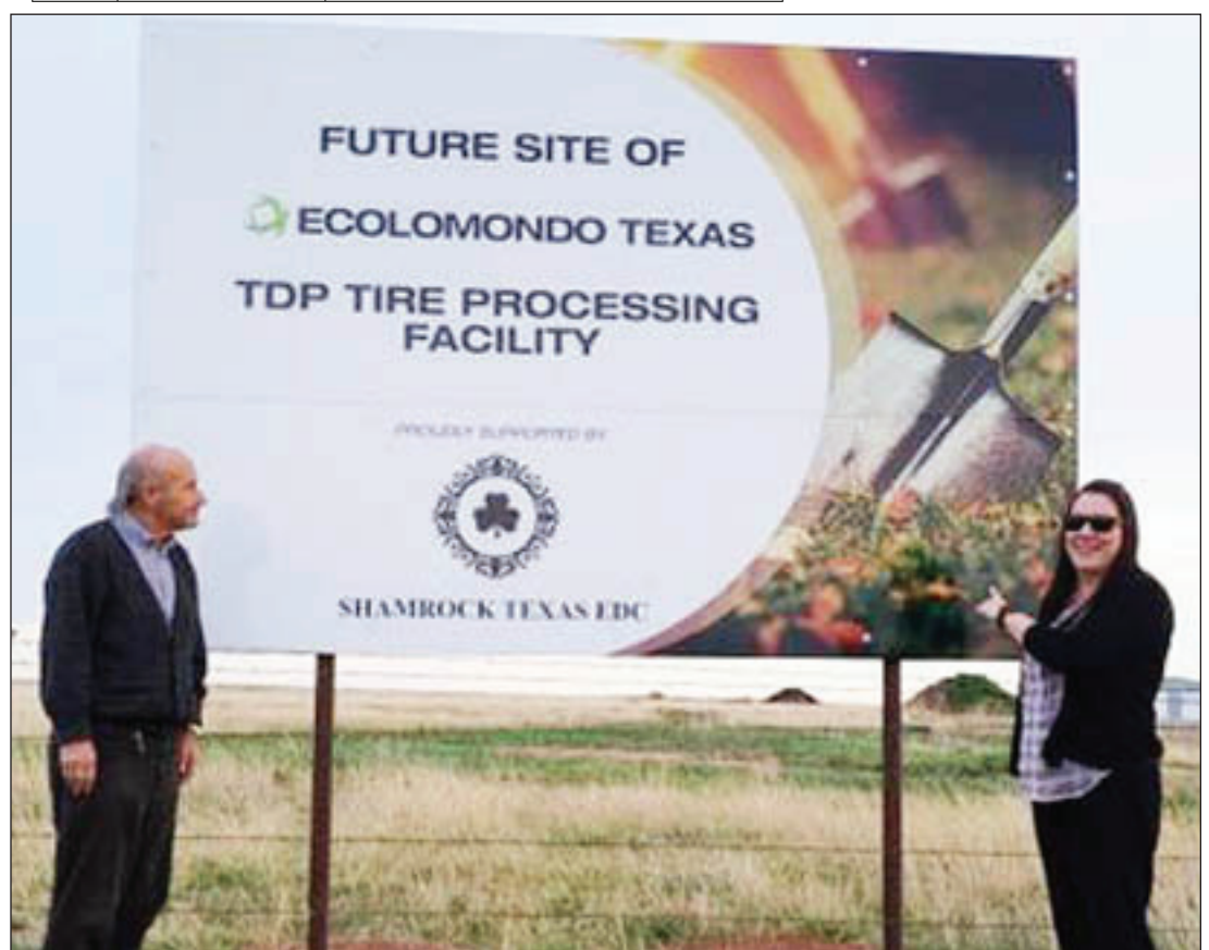
Shamrock EDC and The City of Shamrock had the pleasure of welcoming Ecolomondo to town this week. Thank you to everyone who helped show them Texas hospitality!