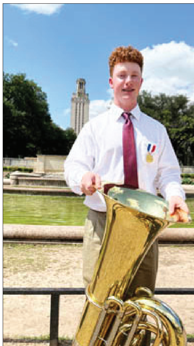
Nicholas Sparks Tuba