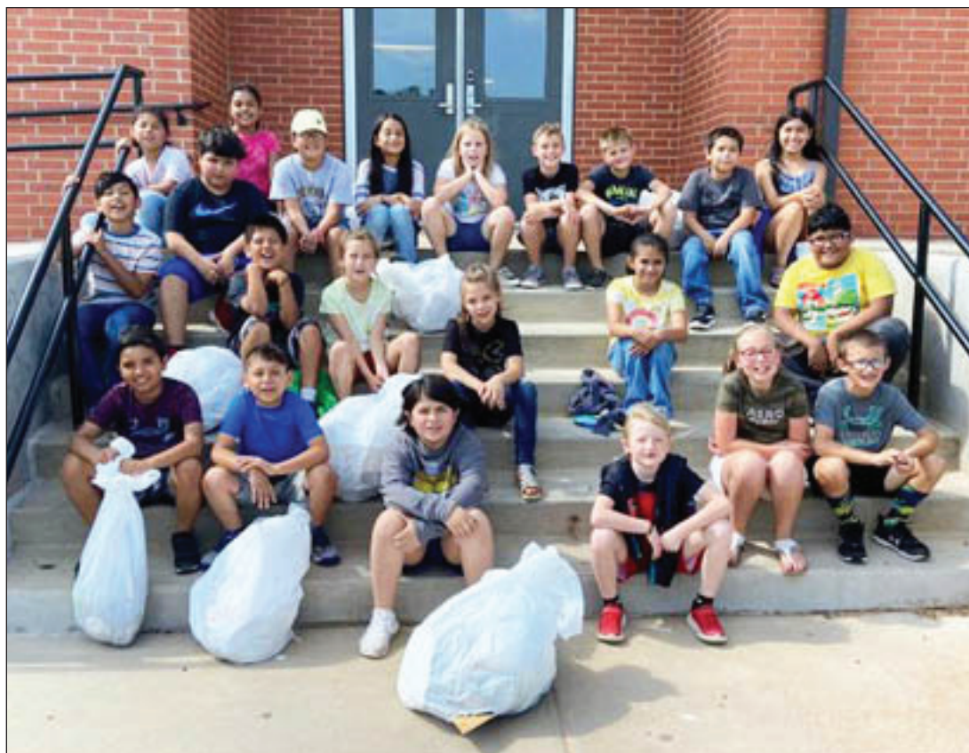
Wheeler third graders picked up trash.