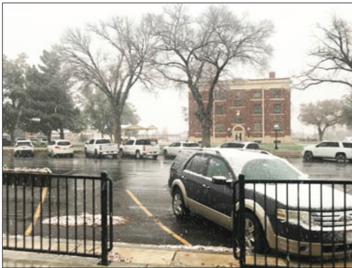
FIRST SNOW: I noticed few flakes of snow falling around 7:30 a.m. and by 8:15 the grass is lightly covered. The snow continued into the afternoon the temperature was around 39°.