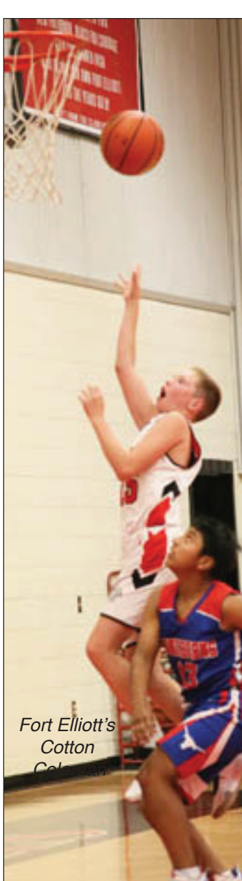
Fort Elliott's Cotton