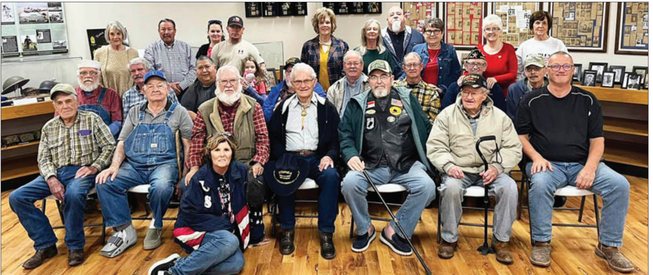
Veterans and guests in attendance at the Veterans Luncheon on Friday, November 11, 2022, at the Wheeler Historical Museum.