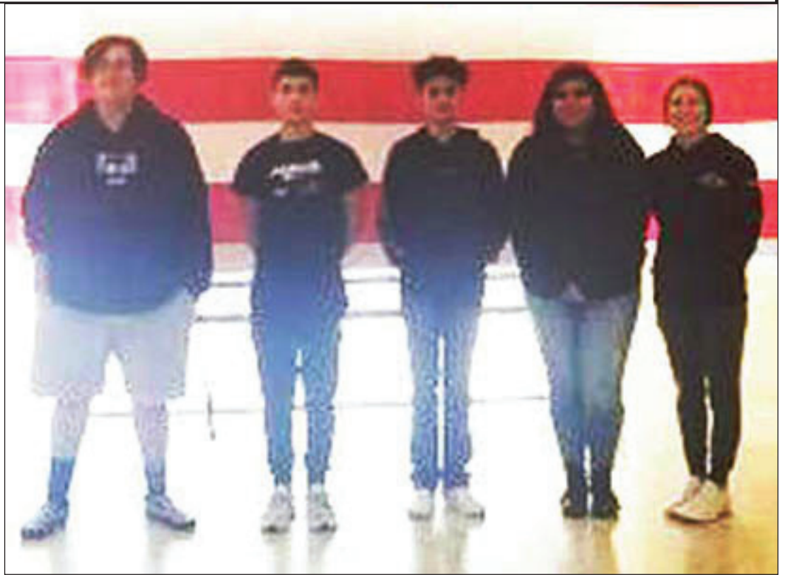
ADVANCE TO STATE: Five members of the “Pride of Wheeler” Band advanced to State. On October 22, the Wheeler Band participated in Area U.I.L. competition. These five students advanced to the state competition.

Donate to the . . . Wheeler Historical Museum through “Panhandle Gives” See Page 4