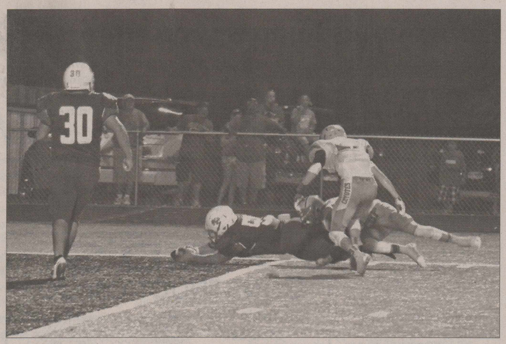
Sheri Baty for The News-Courier