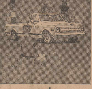
second car Under the rugged chassis,

for big campers. Great under the hood, too. Six or V8. Standard on V8 models is a big 307 cubic-incher.