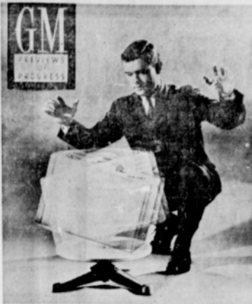
CRAZY SUITCASE — This "no-hands" suitcase takes off for a spin on its own. The time exposure catches it revolving on a turntable, one end in the air, during a "science in action" demonstration of gyroscopic principles which will guide tomorrow's space ships to the Moon. This and other scientific wonders are dramatized in General Motors 40-minute, admission-free stage show, which will be seen this year by more than three million students and adults.

FRIDAY Fish sticks, mustard, English peas, buttered corn, salad, bread, milk and banana pudding.