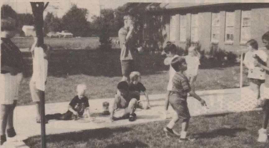
KINDERGARTEN CLASS AT METHODIST VBS