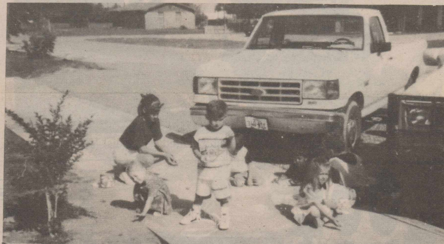
PRESCHOOLERS AT VBS

During the week, the children learned about miracles performed by Jesus, concluding the week with the story of the crucifixion and resurrection.