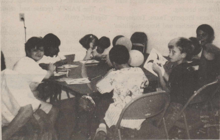
SECOND GRADE STUDENTS who visited Methodist VBS.