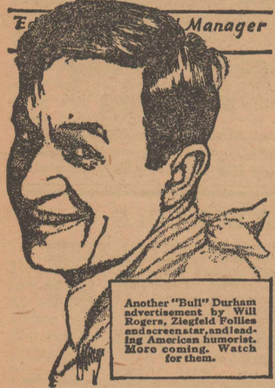
Another "Bull" Durham Rogers, Zigfield Folles and interesting American humorists. More coming. Watch for them.