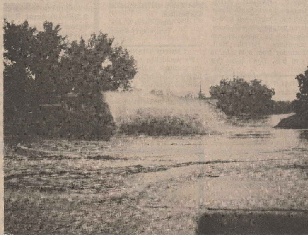
AS AN EAST BOUND pickup truck makes waves while passing through Canal Street in front of Skiles Exxon Station Tuesday morning, it was obvious that the unexpected rain brought a lot of water to Knox City in a very short time. The fast moving cold front dropped temperatures rapidly while bringing 1 and 3/10 inch of badly needed moisture to the Knox City area.

Persons wishing to purchase calendars or list birthdays or anniversaries are asked to please contact Toby Whisenhunt at 658-3842.