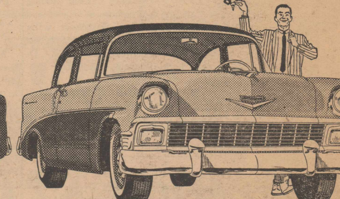
"One-Fifty" 2-door Sedan—with beautiful Body by Fisher!