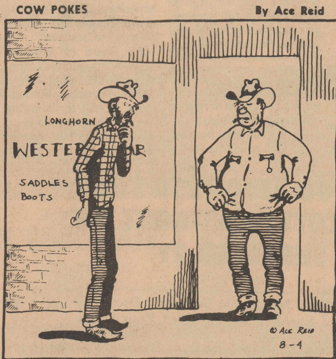
"I still have a 36 inch waist, only it's about 6 inches lower!"

A SMALL CHANGE CAN MAKE A BIG DIFFERENCE! A CHECKING ACCOUNT AT FIRST NATIONAL BANK OF ROTAN CAN SAVE COUNTLESS TRIPS FOR YOU ON BILL PAYING DAYS! PAY-THOSE-BILLS-BY-CHECK-FROM-YOUR-HOME!