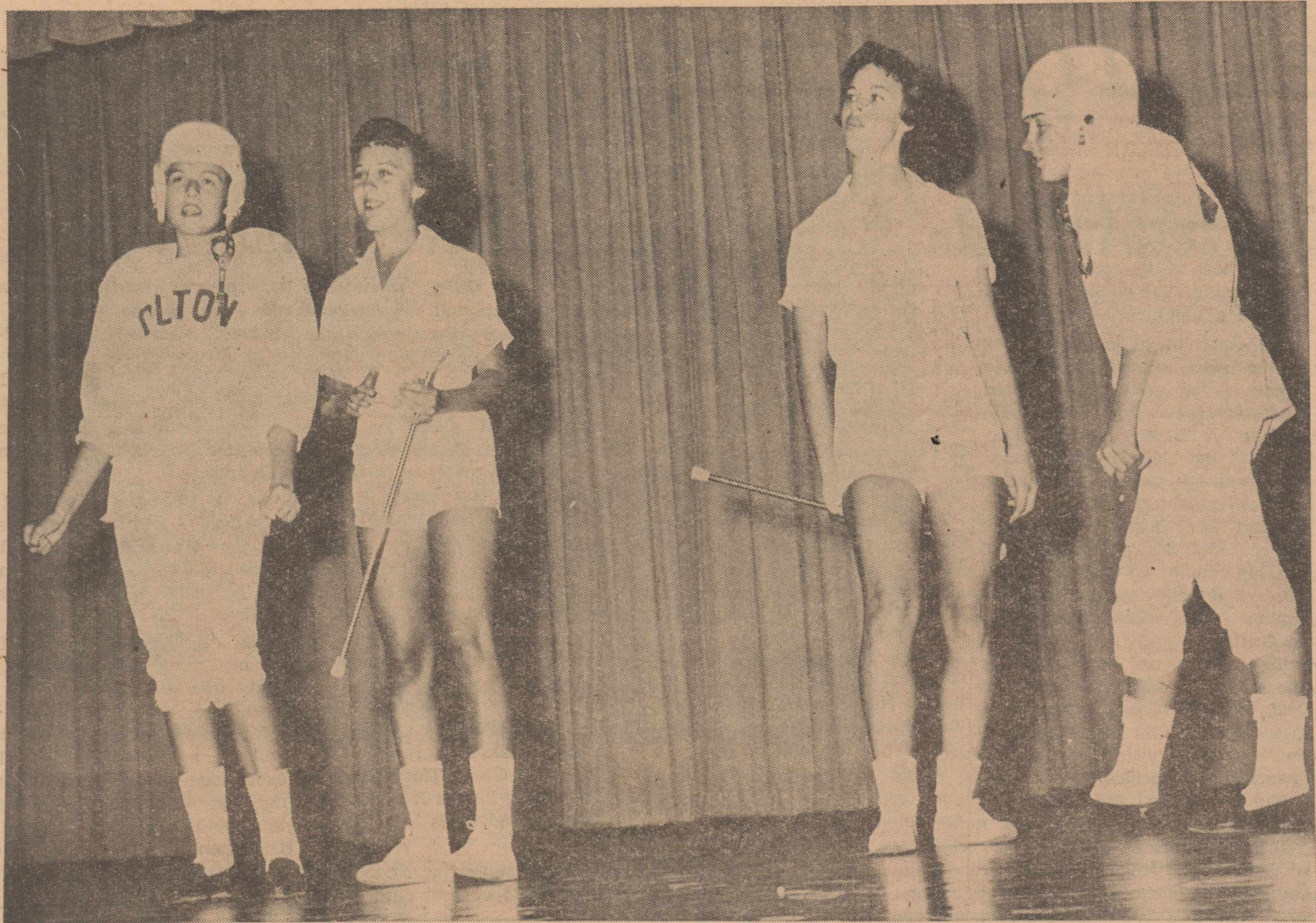
Be A Football Hero" at the Booster Club meeting Friday