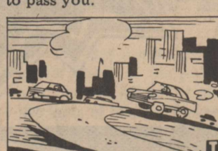
Stay in your lane when making a turn.

When driving at night in a fog, use your low beams; brights shine directly into the fog, you see more glare, less road. In any fog, day or night, drive with lights on, windshield wipers on, defroster on to cut condensation inside the windshield.