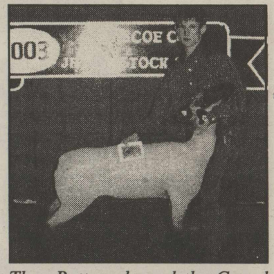
Thor Patton showed the Grand Champion Lamb at the County Junior Livestock Show last week.

Original Samoa (caramel and now through March 9th. All cooktoasted coconut), Aloha Chips ies are priced at $3.00 per package with all proceeds benefiting local Girl Scouts. Cookies may be orand chocolate), the Do-Si-Do dered via fax (806-748-0769) or (oatmeal peanut butter cremes), phone 806-745-2855. For more information, contact Girl Scouts of Caprock Council at 806-745-2855. Caprock Council's eighteen Proceeds benefit individual troop