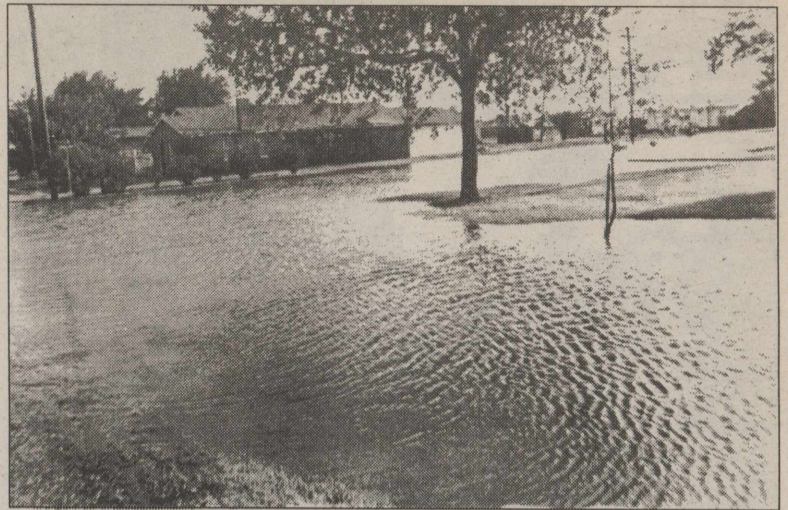
Braidfoot "River" was on the rampage last week after two inches of rain fell on Silverton. This precipitation brought the total for August to 3.91 inches.

You can use vegetable oil or mineral oil in your pet's water to kill mosquito larva. It takes about one tablespoon. You are trying to leave an oily film on the water. Be sure your pet still drinks the water.