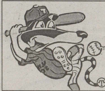
video helps introduce childr to sports at a young age.

(NAPSA)-Sports fans loc ing to get their children in t game are cheering a new vid that helps toddlers get a pla ful introduction to sport America's national pastime particular.