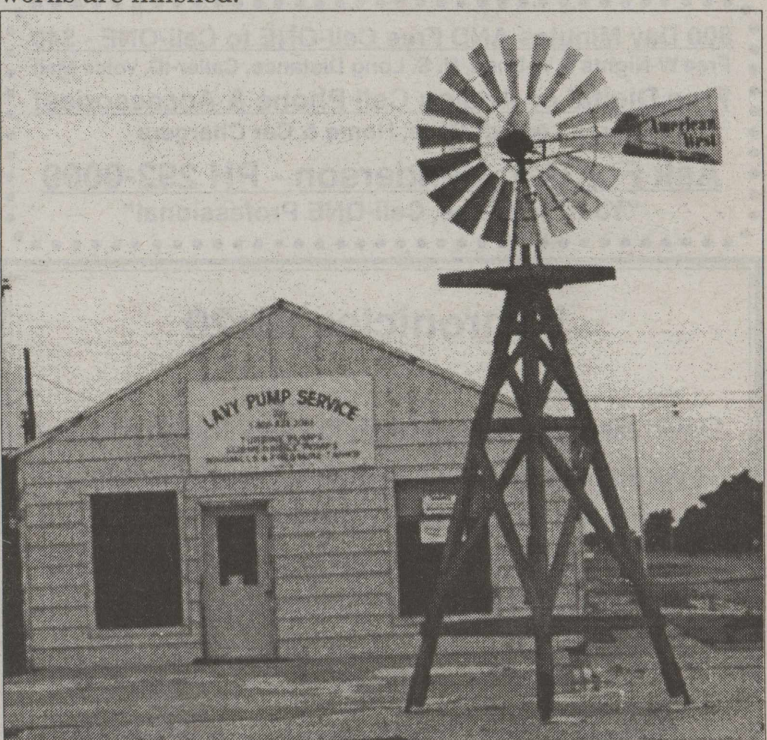
The 2003 pageant will be live and will be carried by Leon Lavy has beautified the corner where Lavy Pump Serhad been contacted by the Channel 7 in Amarillo at 8:00 vice is located with the addition of a windmill.

The Show Barn has been reserved for the concert in case of rain.