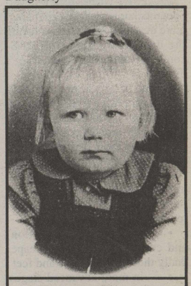
Happy Birthday to this Little Lady!