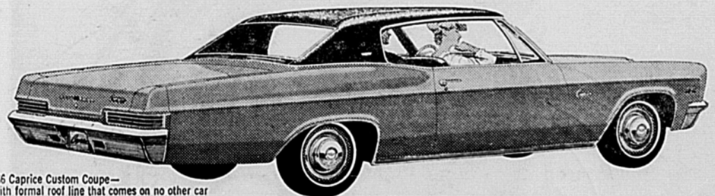
'66 Caprice Custom Coupe — with formal roof line that comes on no other car

A whole new series of elegant Chevrolets with a whole new choice of features even some of the most expensive makes don't offer