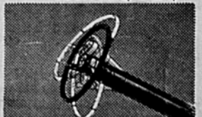
Tilt-telescopic steering wheel moves up or down, in or out, can be added to any model

All told there are 200 ways you can pile luxury upon luxury in the '66 Caprice, before you add the first extra, is luxurious above and beyond any other Chevrolet you've ever seen — and many a more expensive make, too. Ready to move up this year? Your Chevrolet dealer is now ready to move you up about as far as you could want to go.