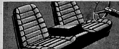
Strato-back front seat, available in Custom Coupe and Sedan, has center armrest that folds up for third person