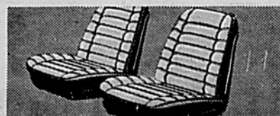
Strato-bucket seats featuring tapered backrests come with console shown at left