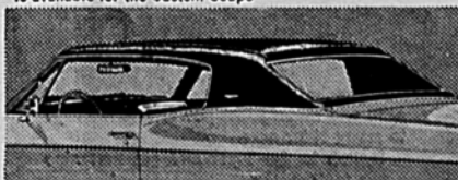
Vinyl roof cover is available. Outside rearview mirror is one of many safety assists standard on all '66 Chevrolets