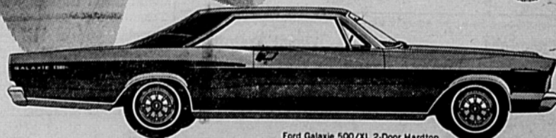
Ford Galaxie 500/XL 2-Door Hardtop

Fastback Fever starts with a happy tingle when you lay eyes on a '66 Ford! Drive one and your pulse goes wild. Come in and get treated right—by me, Doc Fastback, your Ford Dealer. I prescribe a sugar-coated deal on a '66 FORD FASTBACK!