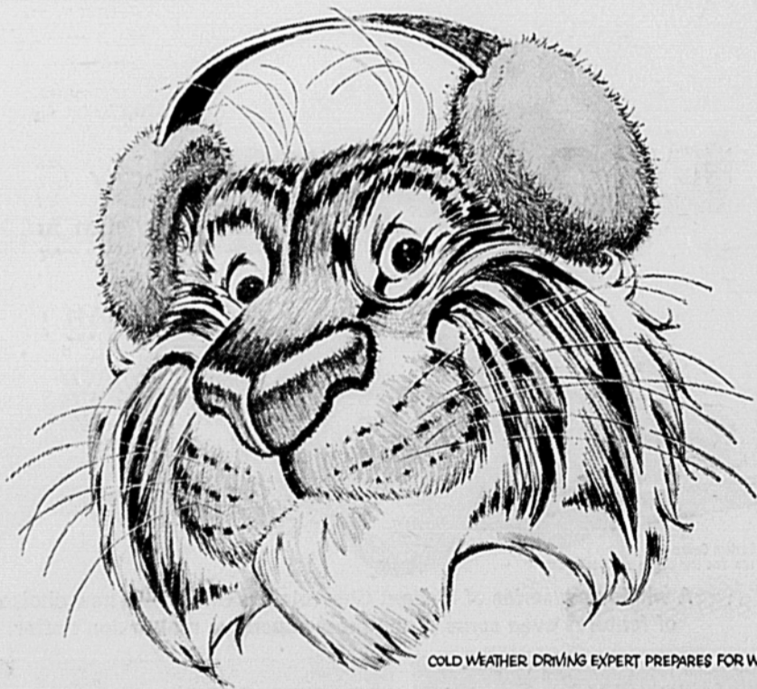
COLD WEATHER DRIVING EXPERT PREPARES FOR WINTER.