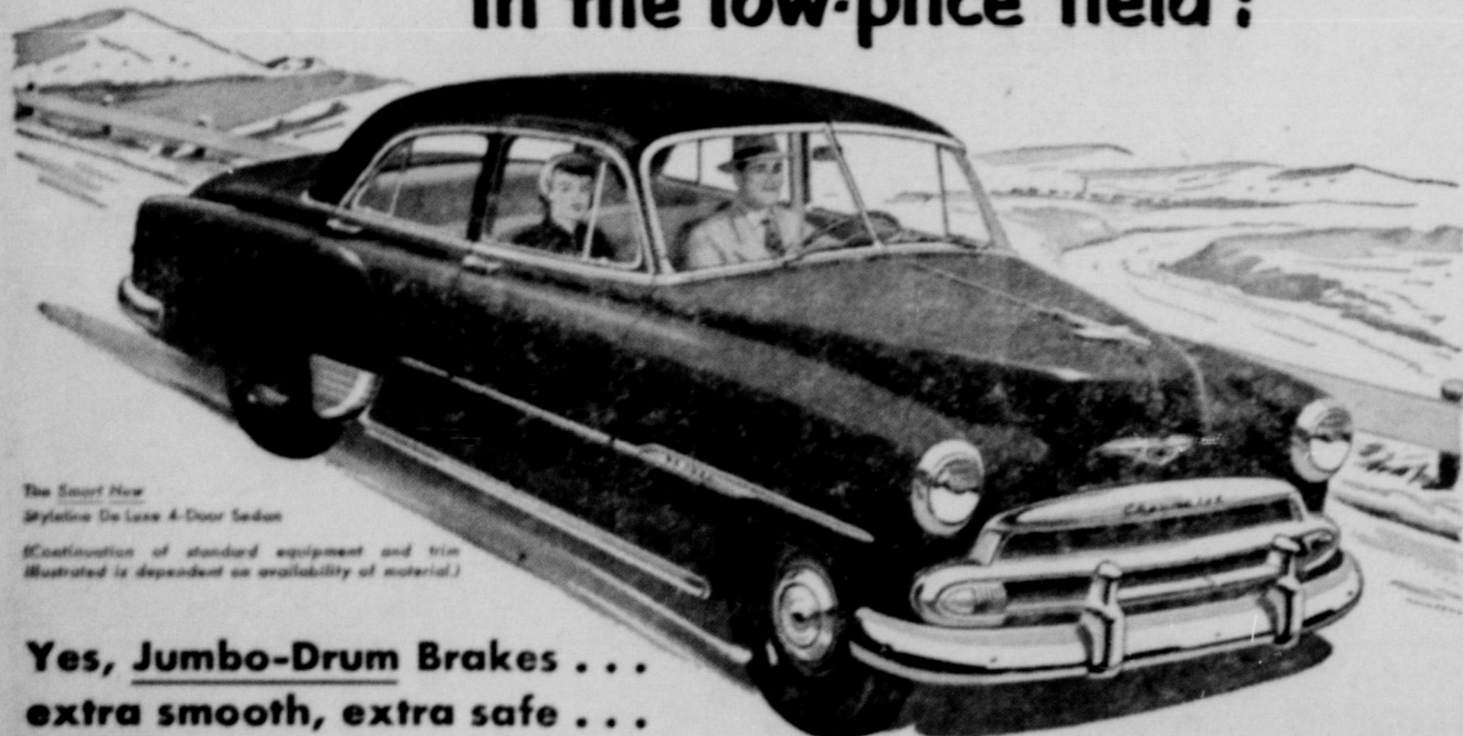
The Smart New Styline De Luxe 4-Door Sedan (Continuation of standard equipment and trim illustrated is dependent on availability of material.)

Yes, Jumbo-Drum Brakes . . . extra smooth, extra safe . . .