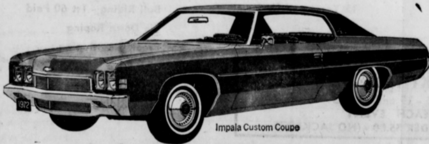
Impala Custom Coupe

NOW 10 MILLION SALES FOR AMERICA'S NO. 1 CAR GOOD SELECTION OF IMPALAS GOING AT YEAR END PRICES DURING JULY AND AUGUST