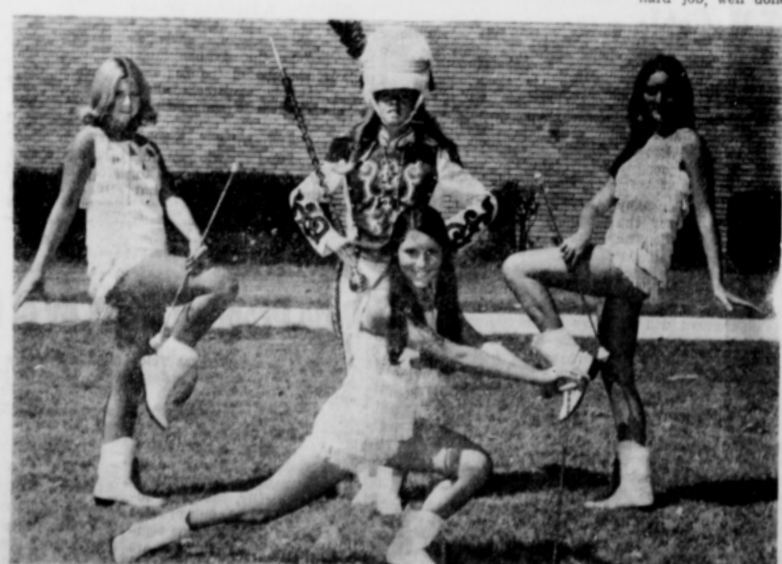
The majorettes have had the pleasure of being out front a number of times this year, in leading the Victory March for the Big Red Marching Band of Baird High School, Again this week, Head Ma