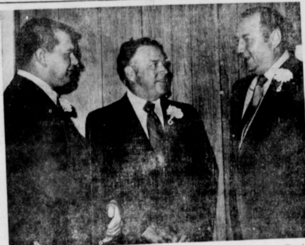
Newly elected officers of the Baird Chamber of Commerce are pictured at the 13th Annual Dinner Meeting Friday night. Left to right: Secretary-