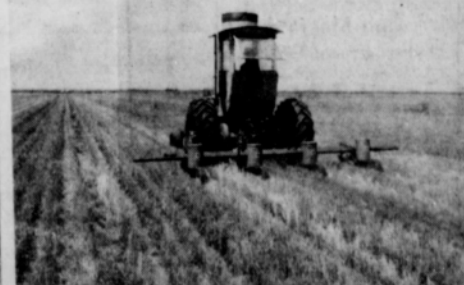
Minimum Tillage In Action. This picture shows forage sorghum being planted into standing wheat stubble. Standard Colters were run in front of the planters using a double tool bar. SEE STORY INSIDE —