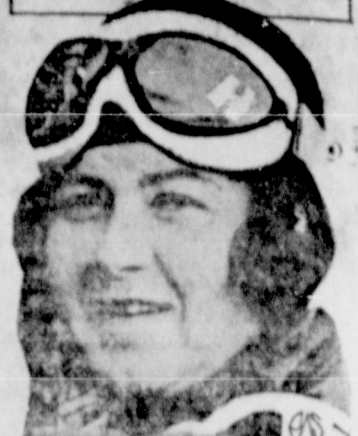
Undismayed by Ruth Nichols' accident, Laura Ingalls continued her plans to become the first woman to fly the Atlantic alone.