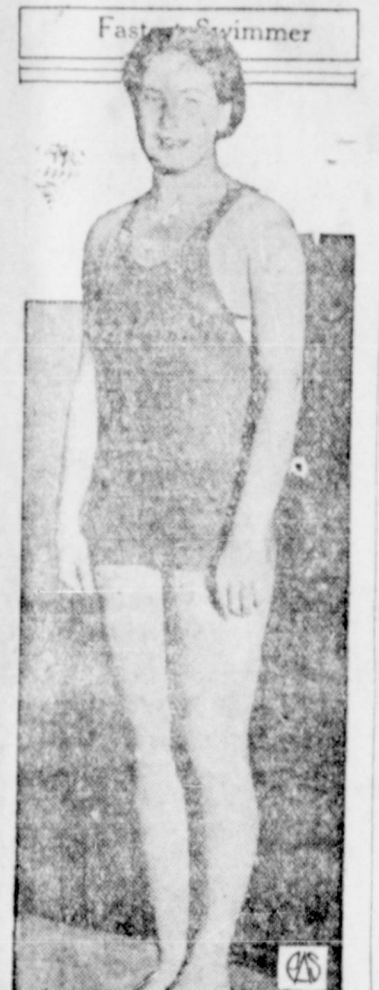
Helene Madison, 17, of Seattle, broke the world's record for women by doing a mile in 24.25 in a 25-foot pool. She holds two U. S. titles.