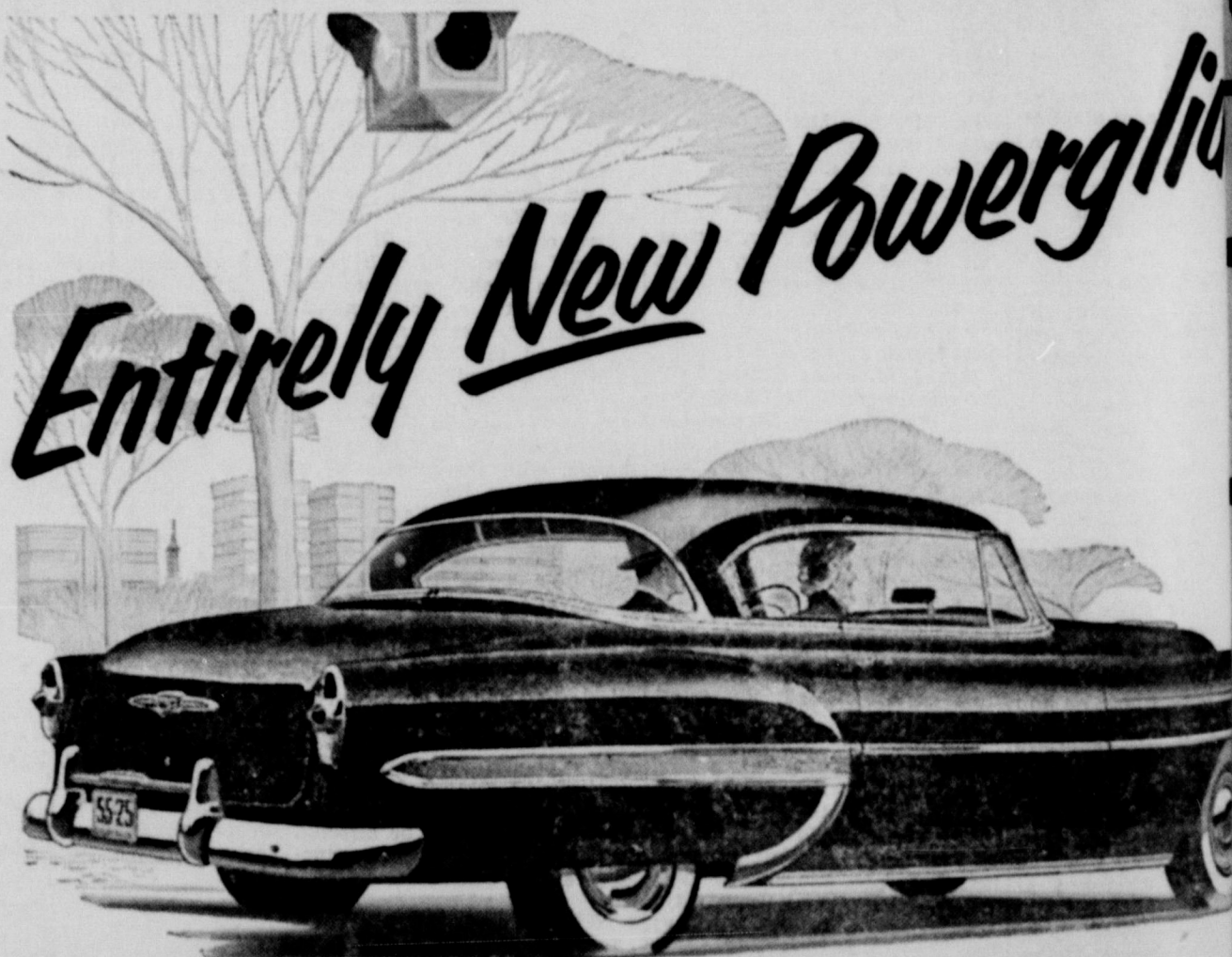
The striking new Bel Air Sport Coupe, one of 16 beautiful models in 3 great new series.

Phone 3021 Bud Thompson, Owner We Deliver