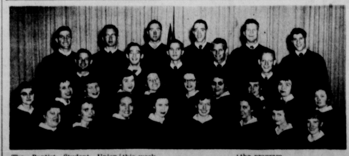
The Baptist Student Union Choir, from Wayland College, Plainview, will appear at the First Baptist Church in Rochester on Saturday, March 21 at 7:30 p. m., it was announced this week.