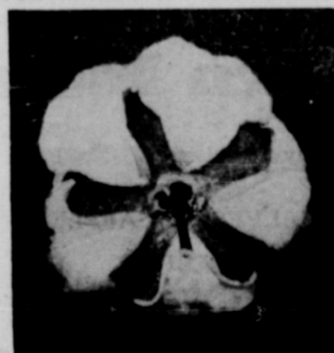
The Largest Boll, Most Storm-Proof Cotton A Prolific Producer of High Grade One Inch Staple