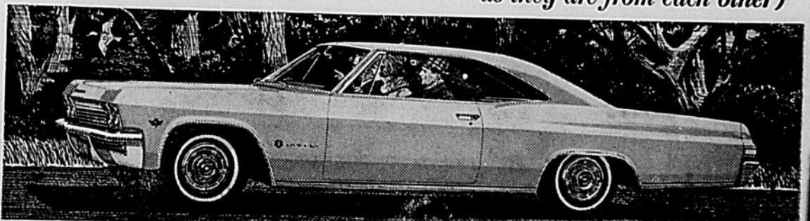
CHEVROLET — As roomy a car as Chevrolet's ever built. Chevrolet Impala Sport Coupe

Discover the difference in the '65 Chevrolets (As different from other cars as they are from each other)