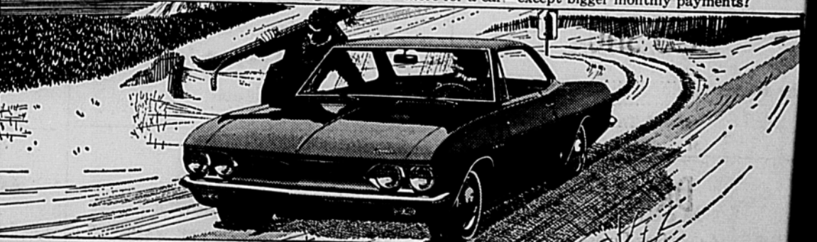
CORVAIR — The only rear engine American car made. Corvair Corsa Sport Coupe

When you take in everything, there's more room inside this car than in any Chevrolet as far back as they go. It's wider this year and the attractively curved windows help to give you more shoulder room. The engine's been moved forward to give you more foot room. So, besides the way a '65 Chevrolet looks and rides, we now have one more reason to ask you: What do you get by paying more for a car—except bigger monthly payments?