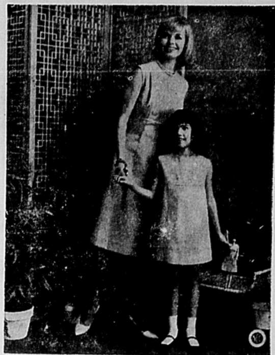
LOOK-ALIKES—Mother, daughter, and even Barbie wear matching outfits of Avondale cotton denim in soft pastel shades. The adult version is a coat dress with raised waistline and gently flared skirt. Daughter and doll dresses are similarly styled with A-line skirts, high rise waist. McCall Patterns 7094, 7127.