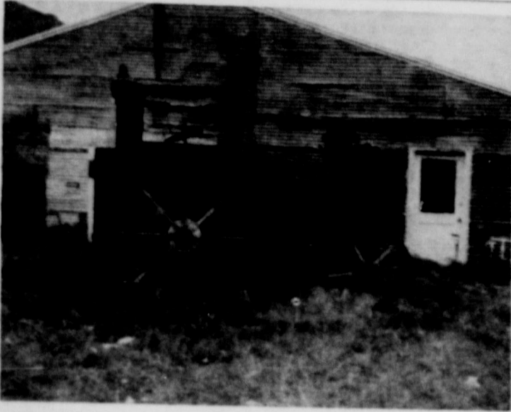
OLD TIMER — Egenbacher Implement traded for this old 1935 Model F20 Farmall last year and has been using it on the farm ever since. Last week they brought it to town to overhaul the motor and Tuesday it was back in operation cutting stalks. The huge steel monster is twice as large as a modern 4-row tractor now, but was developed for 2-row farming.