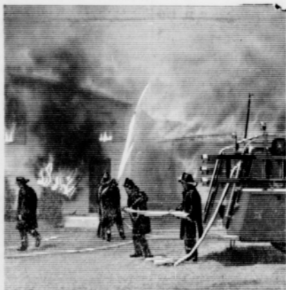
This is when your insurance agent has to go to work for you