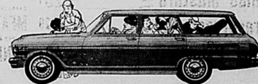
Chevy II Nova 400 4-Door Station Wagon