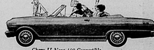
Chevy II Nova 400 Convertible

See the new Chevy II, new Chevrolet and new Corvair at your local authorized Chevrolet dealer's