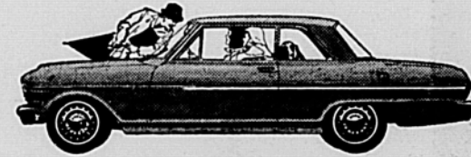
Chevy II Nova 400 2-Door Sedan