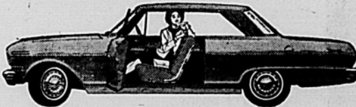
Chevy II Nova 400 Sport Coupe