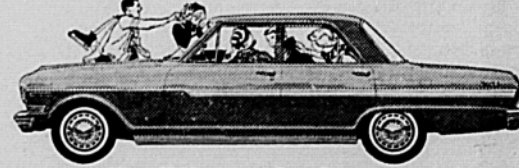
Chevy II Nova 400 4-Door Sedan