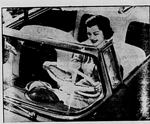
IT'S EASY AS POWER STEERING

The Baird Star, Baird, Callahan County, Texas October 19, 1962