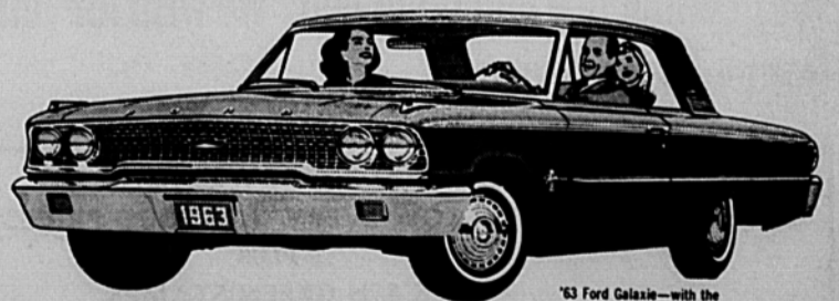
'63 Ford Galaxie—with the look, the power, and now the feel of the Thunderbird!

ROCKEY MOTOR CO. INVITES YOU TO TRY THE '63 FORD GALAXIE'S NEW $10 MILLION RIDE!