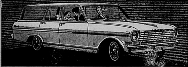
'63 CHEVY II NOVA 400 STATION WAGON—Gives modest budgets lots to brag about.