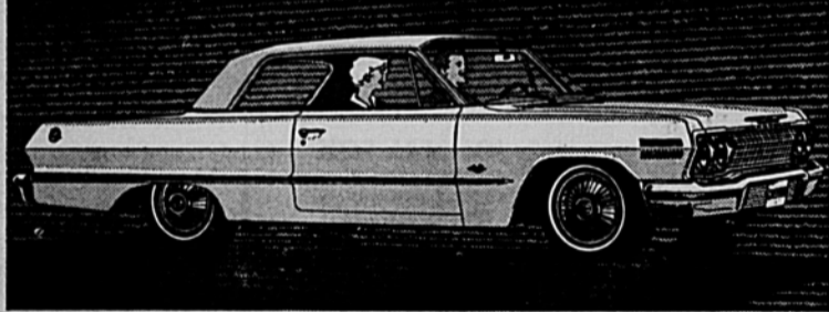
'63 CHEVROLET IMPALA SPORT COUPE—Looks expensive? Look twice at the price.