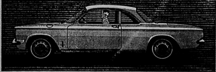
'63 CORVAIR MONZA CLUB COUPE—Lets your whole family get into the sports-car act. Ask about "Go with the Greats," a special record album of top artists and hits and see four entirely different kinds of cars at your Chevrolet dealer's—'63 Chevrolet, Chevy II, Corvair and Corvette