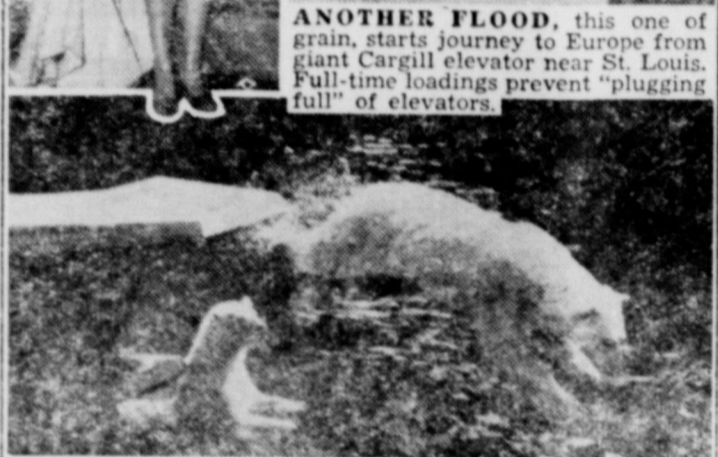
POLAR PLUNGE looks like ideal hot-weather pastime, and these bears in Cologne, West Germany zoo are just the ones that can do it with aplomb and abandon.