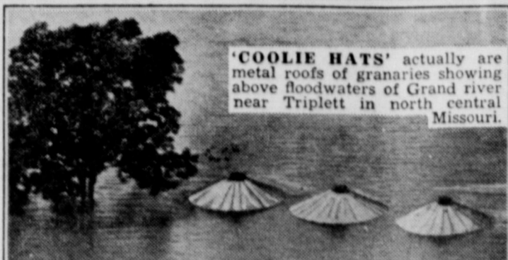
'COOLIE HATS' actually are metal roofs of granaries showing above floodwaters of Grand river near Triplett in north central Missouri.