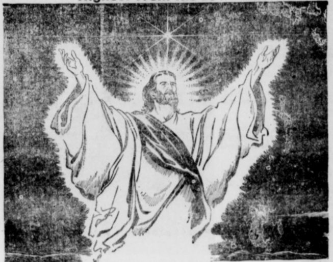
"King of Kings and Lord of Lords" REV. 1916