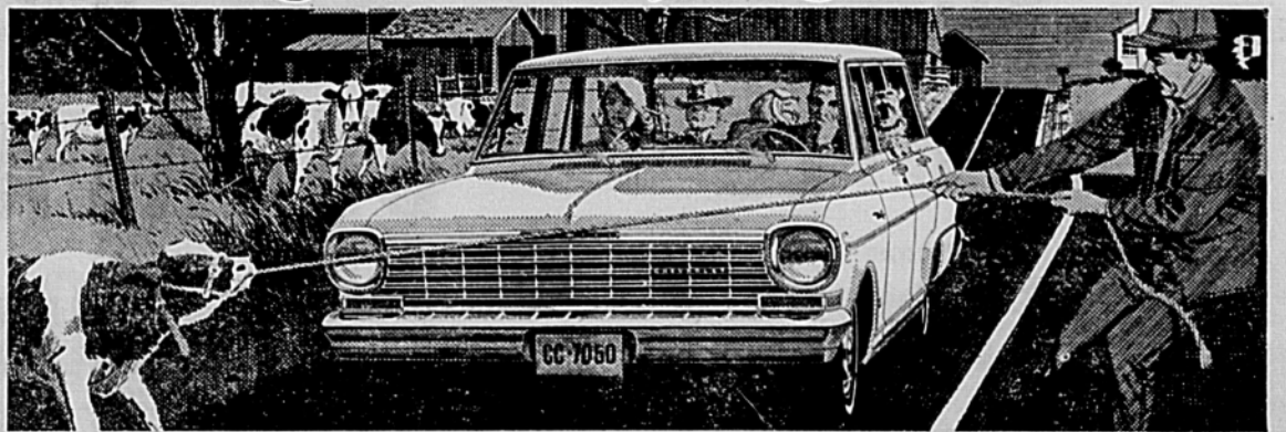
'64 Chevy II Nova Station Wagon

big new V8 power big new self-adjusting brakes