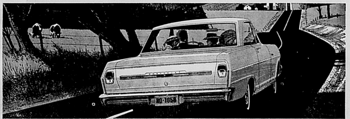
'64 Chevy II Nova Sport Coupe

Member Federal Deposit Insurance Corporation