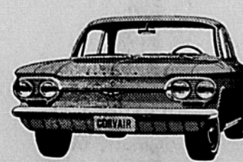
Chevrolet Corvair Monza Club Coupe

Don't wait any longer for a great deal on a sharp new '64 Chevrolet, Chevelle, Chevy II or Corvair! Because right now it's "No. 1 Buy Time" at your Chevrolet dealer's. He's got to move out every '64 he has left.