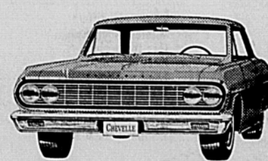
Chevrolet Malibu Sport Coupe