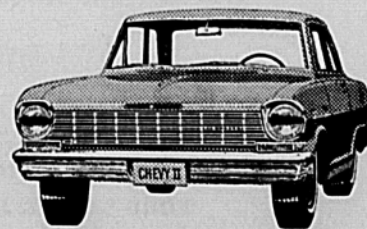
Chevrolet Nova 2-Door Sedan