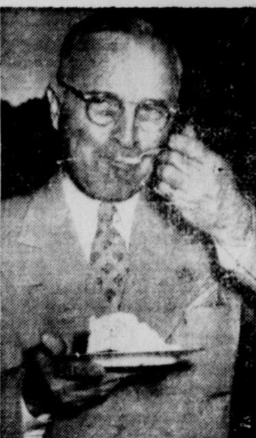
ENJOYS HIS PARTY . . . President Truman, host to 885 wounded war veterans at a garden party on the White House lawn, looks happy as a kid with his favorite dessert, ice cream and cake, even with strike worries. President was said to have left all labor conferences in order to be with the wounded vets at his lawn party.