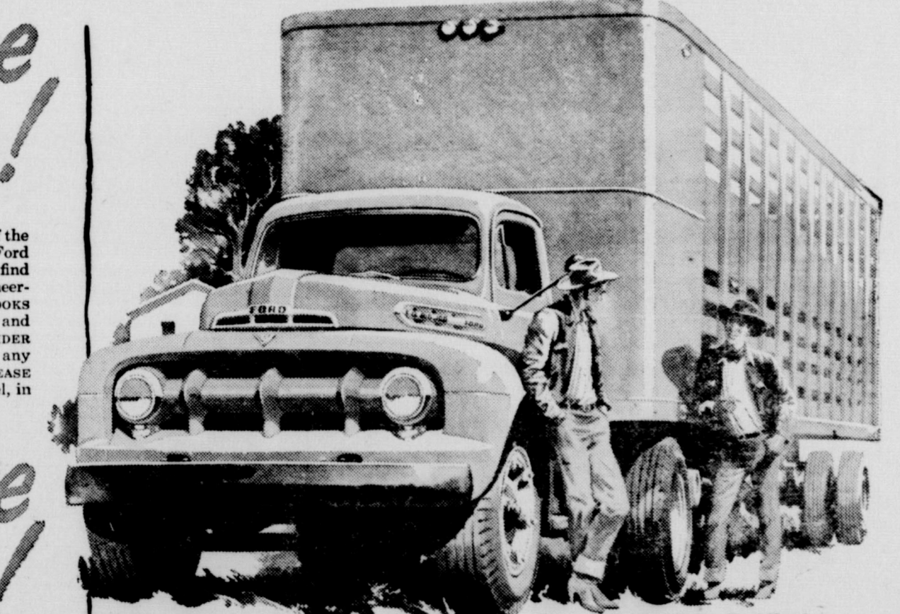
Choose from over 180 new Ford Truck models, from 95-h.p. Pickups to 145-h.p. BIG JOBS like this. You can choose a V-8 or Six.