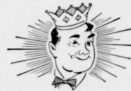
Good Credit Makes You A "King"

Other Services Offered Are: Backhoe, Ditching Service, Septic Tank Cleaning - All Types Sheet Metal Works.