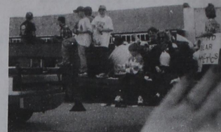
Baird Athletes join the Cowboy Christmas Parade on their athletic float.