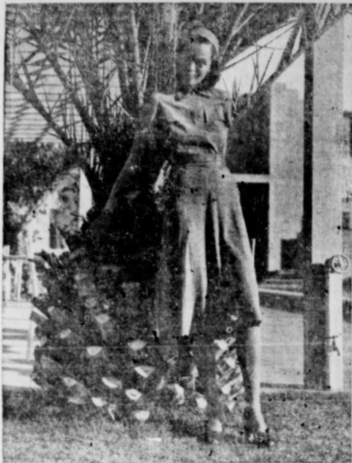
A FOUR-GORED skirt, a shirt, a skull cap and gloves, all to match, in a desert-gold shade, make this sports outfit of Scully suede from the February Harper's Bazaar.