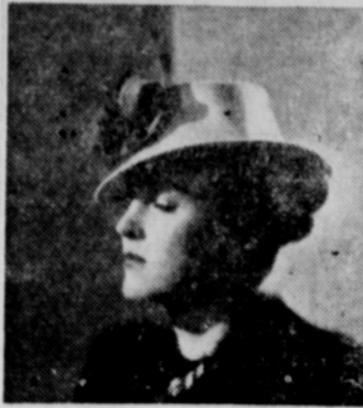
AMONG the spring fashions featured in the February Harper's Bazaar is this white felt hat shaped like a bowl, with a spanking big bow of bright red moire in the front.