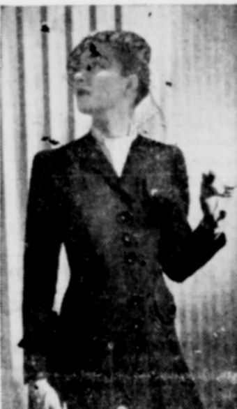
THE crocus of fashion is a navy blue coat like this one of Forstmann wool from the February Harper's Bazaar, worn with a white silk pique Ascot. The tiny sailor of multicolored straw is frothy with veiling.