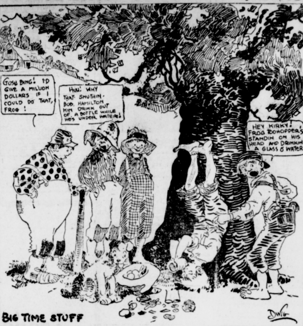
BIG TIME STUFF