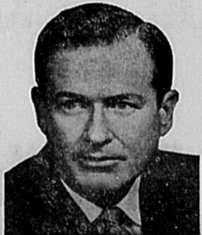
CONG. OMAR BURLESON ... formal announcement