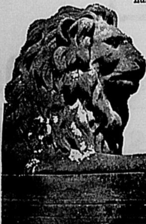
STONELEIGH TERRACE • MAPLE TERRACE • TERRACE HOUSE

For reservations write P.O. Box 6030, Dallas, Texas, 75222, or call Riverside 2-7111, Area Code 214.