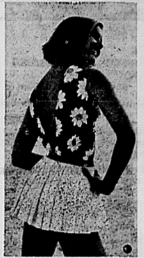
PLUNGE IN —The skirted swimsuit sets off a new trend this season. This smart one-piece style has a jaunty pleated skirt of white cotton sailcloth. The printed cotton knit top is cut with a low-plunging back, high front. By Maldenform Sportswear.