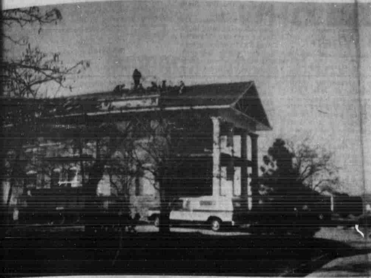
ROOF GOING ON — Seven workers of Black Roofing Company are shown barely visible on top of the Post Sanitarium Building. The workers began installing a new roof on the now Garza County Museum Tuesday afternoon as part of the $29,525 exterior restoration.

The drive will be between the hours of 2 and 5 p.m., and will be conducted by the Blood Services of Lubbock.