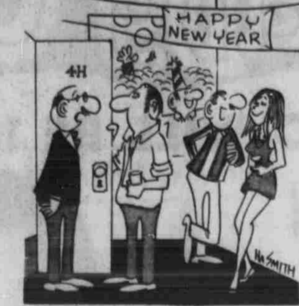
"No, I'm not from next door - I'm from the university. Your party just hit 7.4 on our Richter Scale."

LOST - English Bulldog. Pie-bald Brindle spots over either eye or ear - Spot on base of tail. Reward. 411 West 11th.