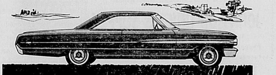
Solid, swift, silent Super Torque Ford for '64! Hundreds of pounds heavier, it's stronger, smoother, steadier than any other car in its field. Sixteen new body styles.

What's new? This year only your Ford Dealer can say 'Everything!'