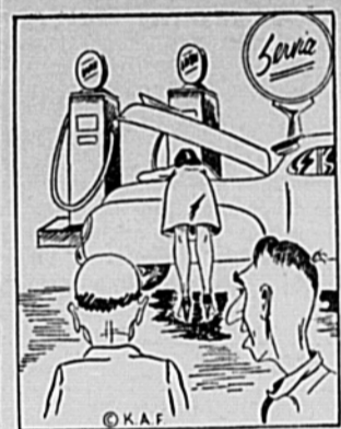
"Best darned oil salesman we ever had."

Good oil is the life-blood of your car. Running it too long isn't economy. For an oil change with the right type seasonal oil, drive to us for service.