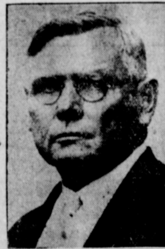
HON. R. S. STERLING

A district Sterling-for-governor rally, announced for Friday night in Abilene, starting at 8 o'clock, will be an all-woman's program—first of its kind this section, noted for its hot politics, has had.