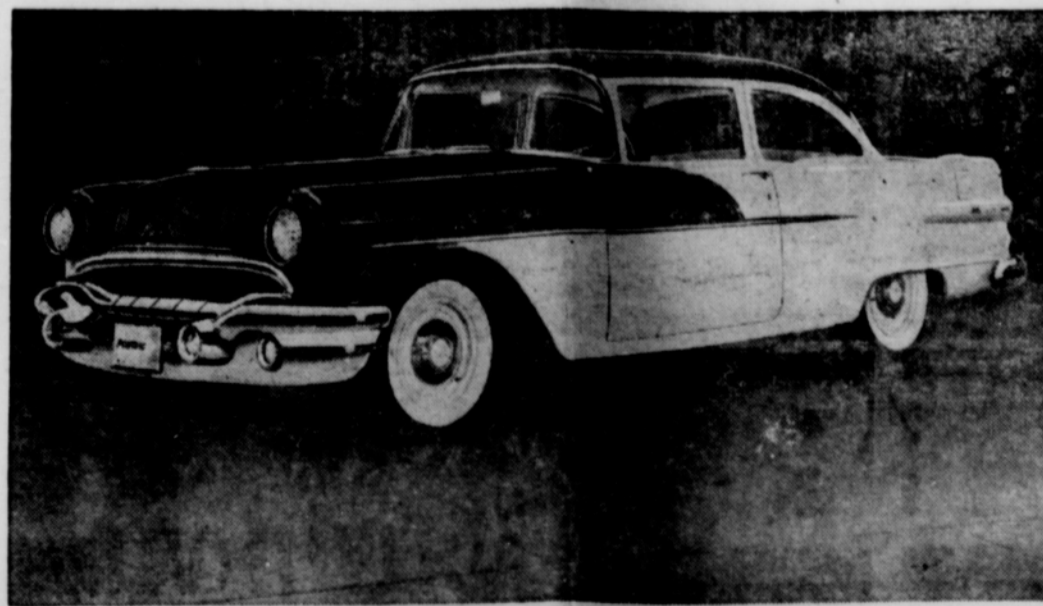
PONTIAC 860 TWO-DOOR SEDAN—Pontiac's 1956 two-door sedan, the most economical model in the big-car class, rides on a 122 inch wheelbase with 206 inches over-all length. It's big 205 hp. Strato-Stream V-8 engine gives it power and performance unequalled in the medium priced range. "Vogue" two-toning and luxurious interiors are other features that make it the best dollar for dollar buy.

Do you know one of the most attractive yards in town? Jerry Loper's. That lush green lawn and the deep shades of well kept trees and shrubbery is a constant delight to see, and a pleasure, we know, to the nice folks who have made it so.