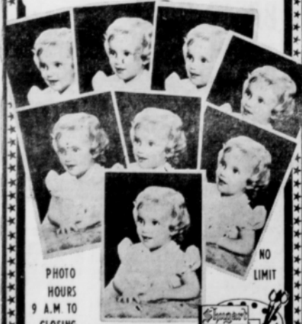
PHOTO HOURS 9 A.M. TO CLOSING

KING SIZE WALLET CREATIVE COLOR PORTRAITS FOR ONLY 8 99c