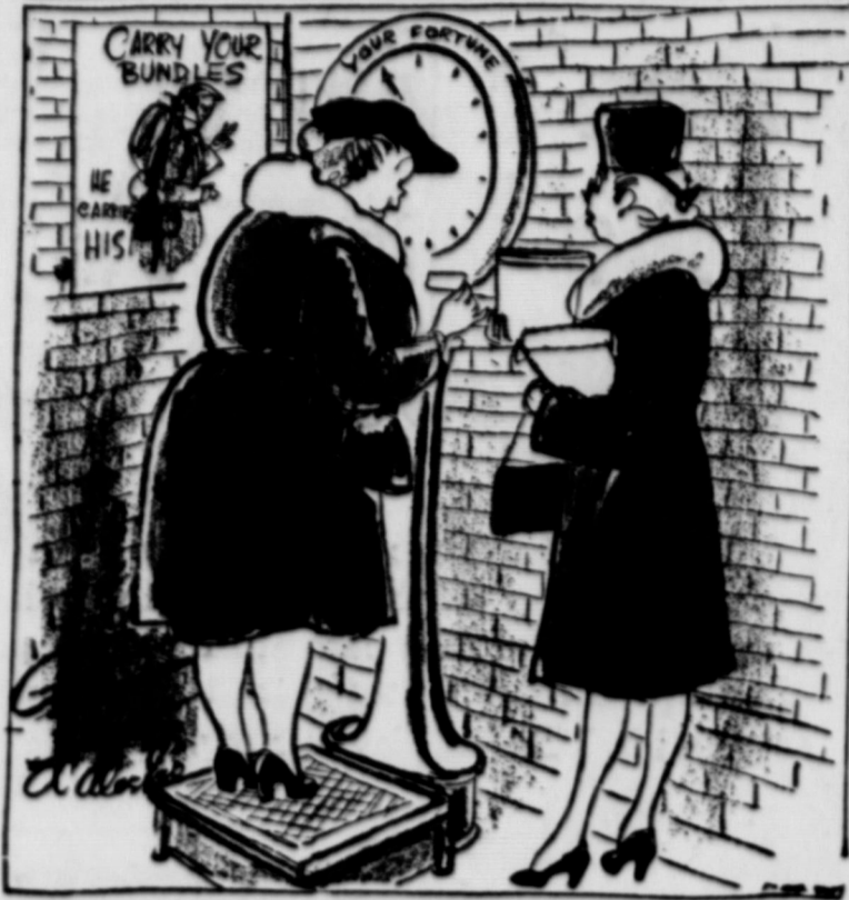
"This card says, would I be willing to sign a contract with a circus?"